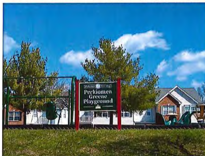
LOCATION: 1001 Greene Boulevard