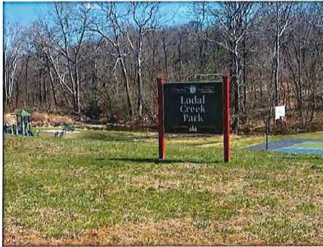
LOCATION: 384 Bridge Street