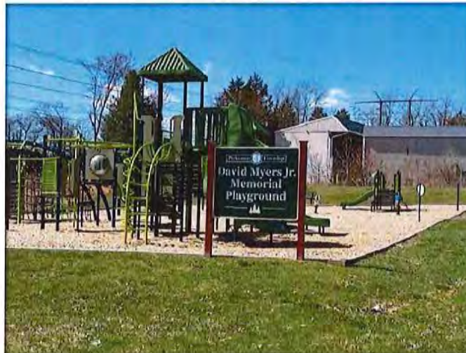
LOCATION: Perkiomen Township Administraton Building, 1 Trappe Road